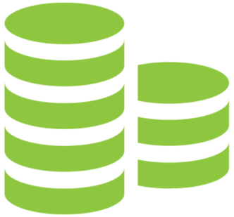
Funding Application Assistance