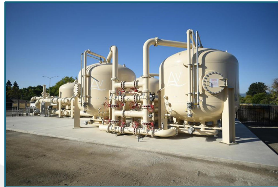
Photo: PFAS Ion Exchange Plant for City of Anaheim