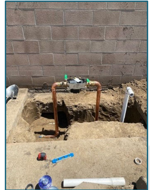
Photo: Del Rancho Y Emergency Funding for Interconnection