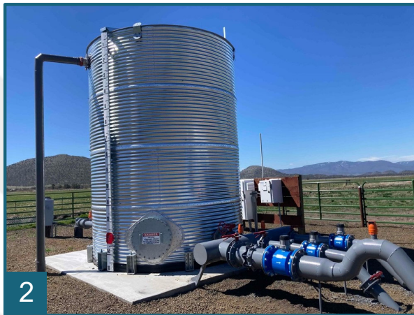
Photos: 1) Mobile bioreactor at Chualar Creek, 2) Stockwater System at Hart Ranch and 3) Before and after Stream Restoration at Scott River