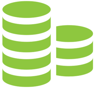
Funding Application Assistance