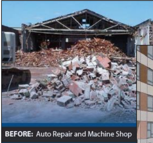
BEFORE: Auto Repair and Machine Shop