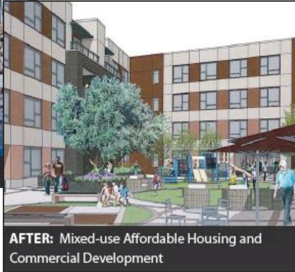
AFTER: Mixed-use Affordable Housing and Commercial Development

A property , the expansion, redevelopment, or reuse of which may be complicated by the presence or potential presence of a hazardous substance, pollutant, or contaminant.